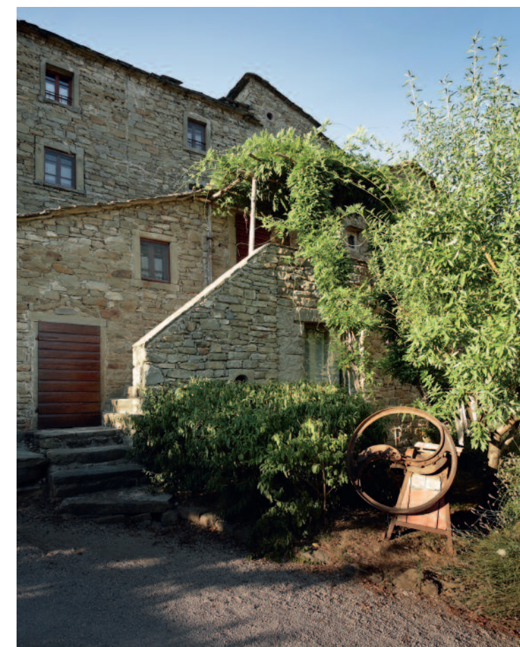
FEATURE NATALIE FLAUM